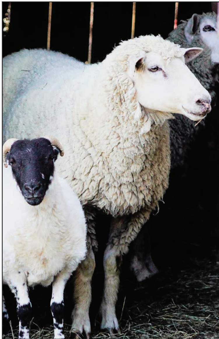
aganza, and the Southern Adirondack Fiber Festival.

Many of the Tour's fiber farmers exhibit their animals and products nationally, where they have won major awards at events like the Eastern States Exposition, the NYS Sheep and Wool Festival, the New England area North American Cashmere Goat Show, the Empire Alpaca Extrav-