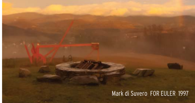
Mark di Suvero FOR EULER 1997

t: 518.854.7674 e: info@salemartworks.org http://salemartworks.org