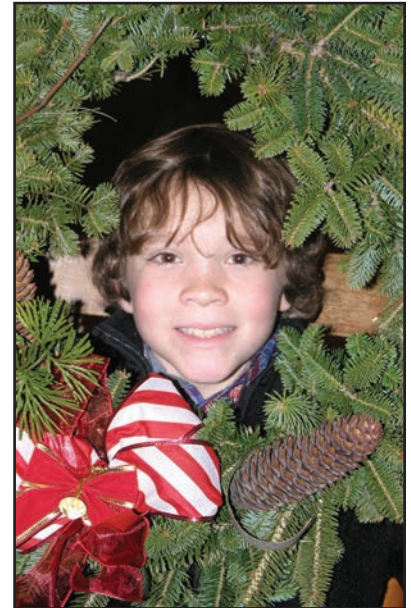
Wreath-making is fun for everyone!

RUPERT, VT – Merck Forest and Farmland Center will host its annual Wreath-Making Workshop at the Joy Green Visitor Center, Saturday, December 5 from 1 to 4 p.m. A great way to get into the holiday spirit, this laid back workshop will allow participants to make their own wreath. Boughs, sourced from the MFFC farm, and ribbons are provided. Feel free to bring your own ornaments to add on as well.